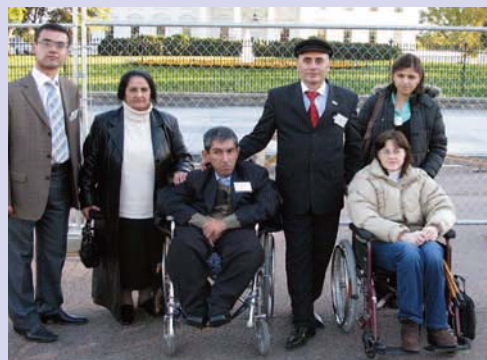
Azerbaijani participants headed for Syracuse, N.Y., take in the White House during their Washington, D.C. orientation.

Four delegates with disabilities, including two wheelchair users, spent early November in Syracuse, N.Y., studying services, programs, and laws that help Americans with disabilities participate fully in community life. The delegation—believed to be the first of its kind to travel to the United States from Azerbaijan—visited inclusive schools, a restaurant with staff with disabilities, social-services and employment agencies, and the Onondaga County Board of Elections. After returning home,